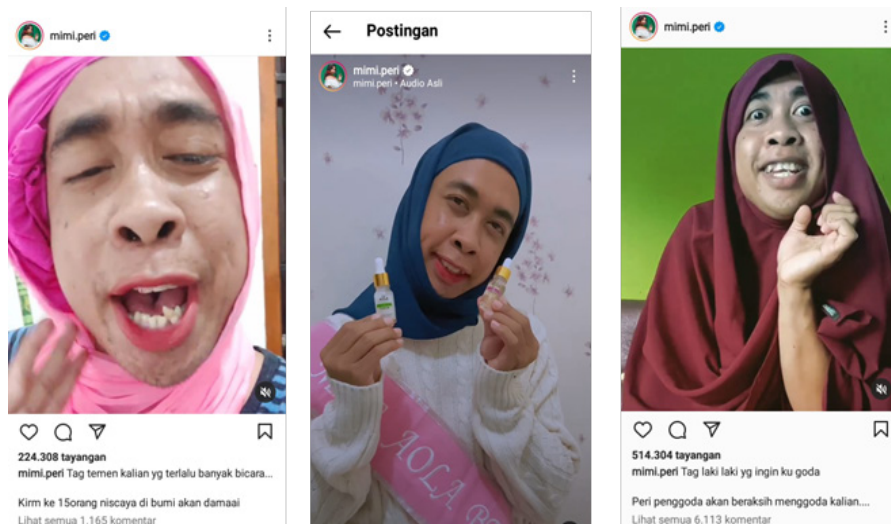
Figure 2: Gender Representation on Instagram

On the one hand, the content uploaded by the @mimi.peri account on Instagram greatly discredits the figure of women (Figure 2). The account represents women as chatty, seductive, and selfish. As if it has become a characteristic of the @mimi.peri account, the content actually gets a lot of netizen attention and is able to increase ratings. Commonly, similar content will be continuously posted in order to realize the goals and achieve the orientation of the Instagram account manager. This dynamic "seems" to be in line with the theory of reinforcement and punishment developed by Edward L. Thorndike. This theory states that activities that have a positive impact are likely to be repeated, and conversely, activities that have a negative impact are unlikely to be repeated (Thorndike, 1905). Thus, as long as the content is able to get the attention of many netizens, it will continue to appear.