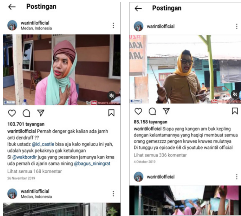
Figure 5: Gender Representation on Instagram

The three Instagram accounts have something in common, namely, using male actors in the role of women. The @mimi.peri account depicted a female figure with silly behavior and improvised female gender traits and characters to invite laughter. There are even uploads that expose the sexual side of women with lewd styles using modest equipment. On the one hand, Garcia & Solona's research found that there are also feminist Instagramers who try to present real women demanding gender equality (Martín-García & Martínez-Solana, 2019) or also those who present the interpretation of the Qur'an proportionally - read egalitarian (Jamaluddin & Aisa, 2023).