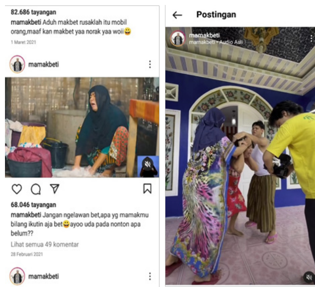
Figure 4: Gender Representation on Instagram

Content that represents gender stereotypes with comedic nuances does not only exist on the @mimi.peri account. However, similar content also appears on the @mamakbeti account and the @warintilofficial account, as shown in Figures 4 and 5.