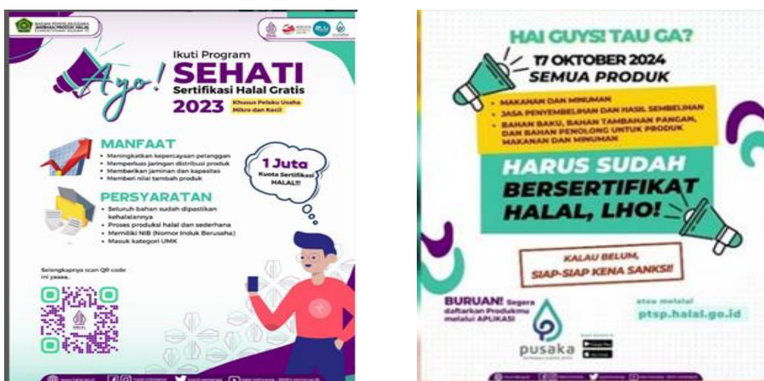
Figure 3. Infographic on Halal Certification (Akun Ig BPJPH Kemenag @halal.indonesia)

The number of MSEs that have been accompanied until the issuance of their halal certificate by P3H KUA Taman Kota Madiun District from November 2021 to August 2023 can be seen in Table 1.