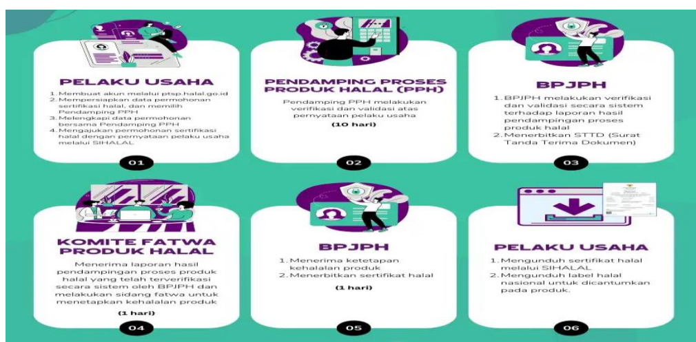
Figure 2. Sehati Service Flow ( bpjph.halal.go.id , 2023)

In its development, the implementation of the Sehati program still experiences various obstacles due to the lack of socialization, lack of awareness and responsiveness of MSE actors to the Sehati program, related stakeholders who have