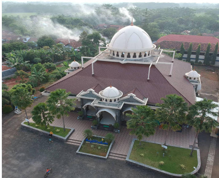
Figure 2. Photo of the Al-Khuzaemah Mosque From Above