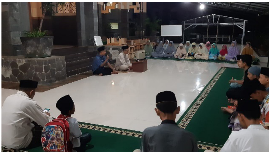
Figure 3. Pengajian Malam Ahad (Sunday Night Study)

The study circles ( pengajian ) organized by Masjid Al-Khuzaimah closely resemble the characteristics of a social movement phenomenon. Some regularly scheduled study circles include the Sunday Night Study (Figure 3), 17th of the Month Study, and Morning Spirit Study. Of particular note is the Morning Spirit Study, which exemplifies a collaborative effort with Muhammadiyah Vocational School in Kajen. This initiative involves students, teachers, staff, and even members of the mosque's surrounding community. This collaborative nature of the activities underscores their role in fostering a sense of community and cooperation.